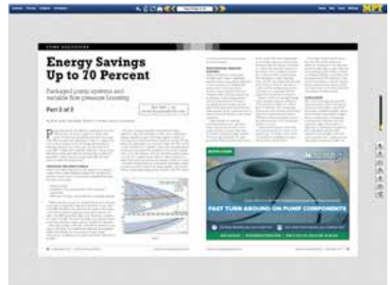
MPT Digital Edition

*For full page ads and two-page spreads, add a bleed of at least .125" (1/8 inch) on all sides